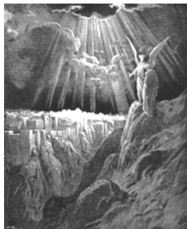
Rev 21:2 - New Jerusalem