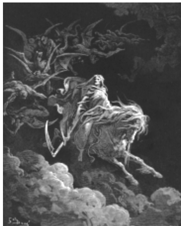
Rev 6:8 - Fourth Horseman