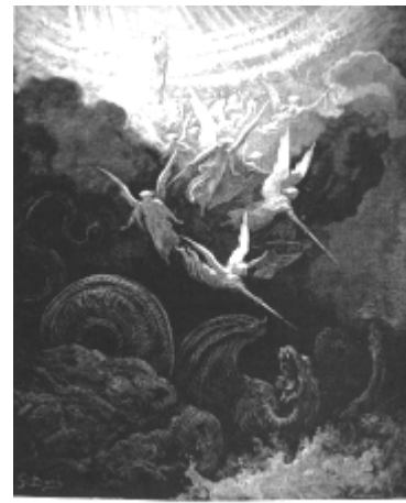
Rev 12:1 - Woman & Dragon