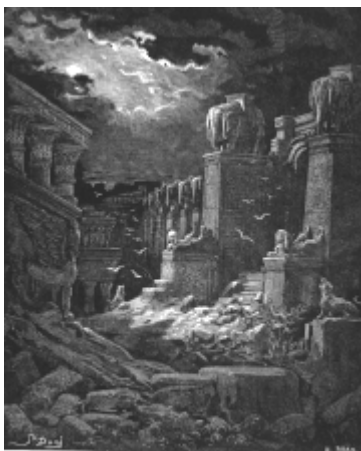
Rev 18:5 - Fall of Babylon