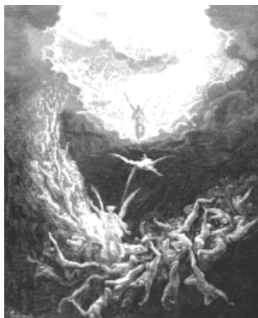
Rev 20:12 - Final Judgment