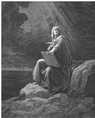
Rev 1:9 - John on Patmos